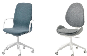
IKEA chair (LÅNGFJÄLL, HATTEFJÄLL)