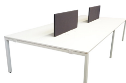
VITRA Workit table