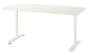
IKEA BEAKANT table