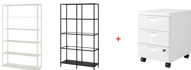
IKEA rack (Fjalkinge, Vittsjo) + 2 x ERIK drawer unit

CZK 500 / 3 pcs / month Fjalkinge rack 118 x 193 cm VITTSJO rack 100 x 175 cm