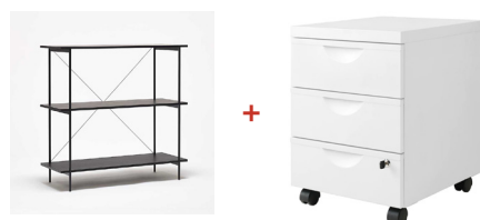
MASTER&MASTER rack + 2 x ERIK drawer unit

CZK 1,000 / 3 pcs / month Rack 776 x 802 x 290 mm