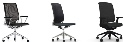
VITRA chair (Meda, Meda Pro, AM chair)