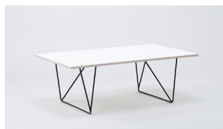
MASTER&MASTER table Flat Diamond