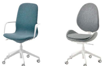
IKEA chair (LÅNGFJÄLL, HATTEFJÄLL)