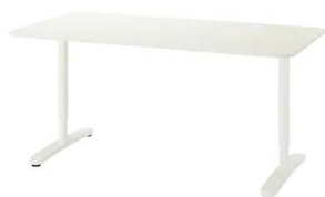
IKEA BEAKANT table