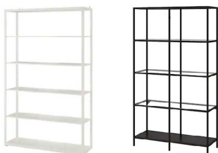
IKEA rack (Fjalkinge, Vittsjo)

CZK 500 / 1 pcs / month Fjalkinge rack 118 x 193 cm VITTSJO rack 100 x 175 cm