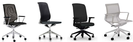
VITRA chair (Meda, Meda Pro, AM chair, Physix)