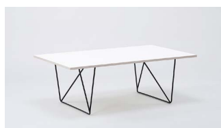
MASTER&MASTER table Flat Diamond