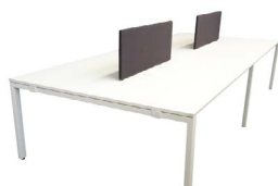
VITRA Workit table