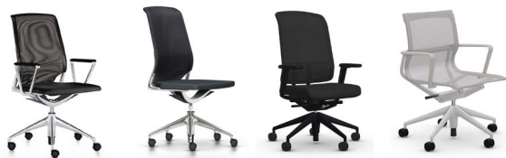
VITRA chair (Meda, Meda Pro, AM chair, Physix)