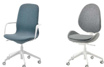
IKEA chair (LÅNGFJÄLL, HATTEFJÄLL)