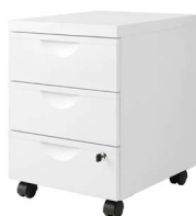
IKEA drawer unit

CZK 500 / 1 pcs / month Fjalkinge rack 118 x 193 cm VITTSJO rack 100 x 175 cm