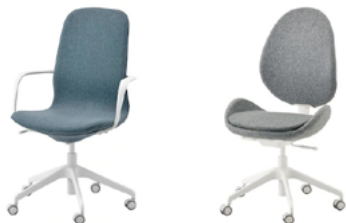
IKEA chair (LÅNGFJÄLL, HATTEFJÄLL)