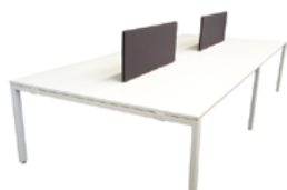
VITRA Workit table