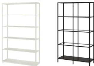
IKEA rack (FJÄLKINGE, VITTSJÖ)

CZK 500 / 1 pcs / month Fjalkinge rack 118 x 193 cm VITTSJO rack 100 x 175 cm