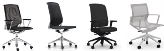
VITRA chair (Meda, Meda Pro, AM chair, Physix)